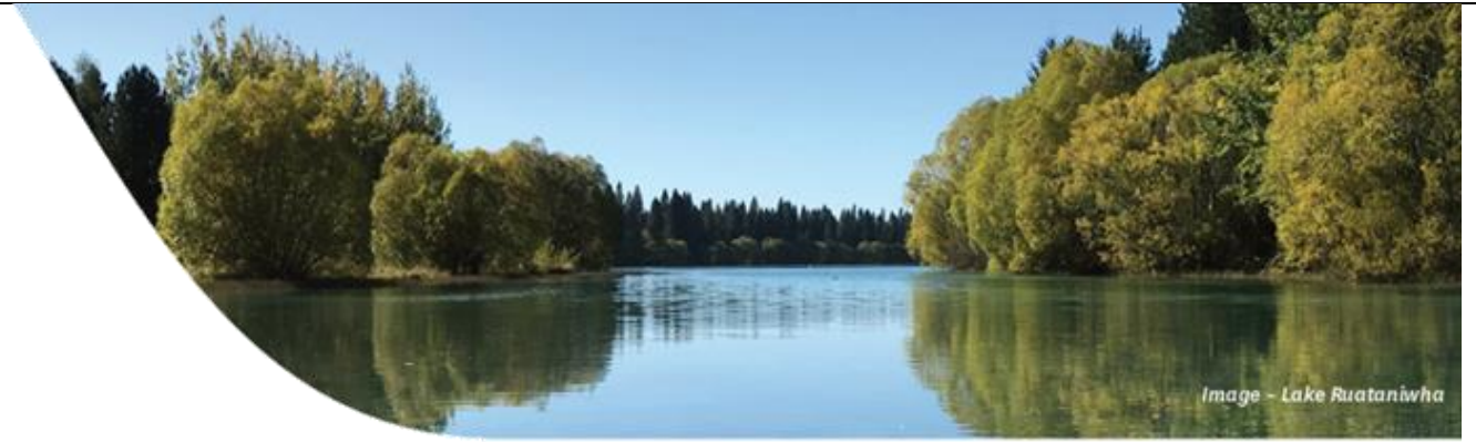
Image - Lake Ruataniwha