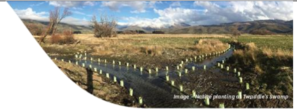
Image – Native planting at Twiddle's Swamp

This summary highlights the key actions agreed by the zone committee for the next three years.